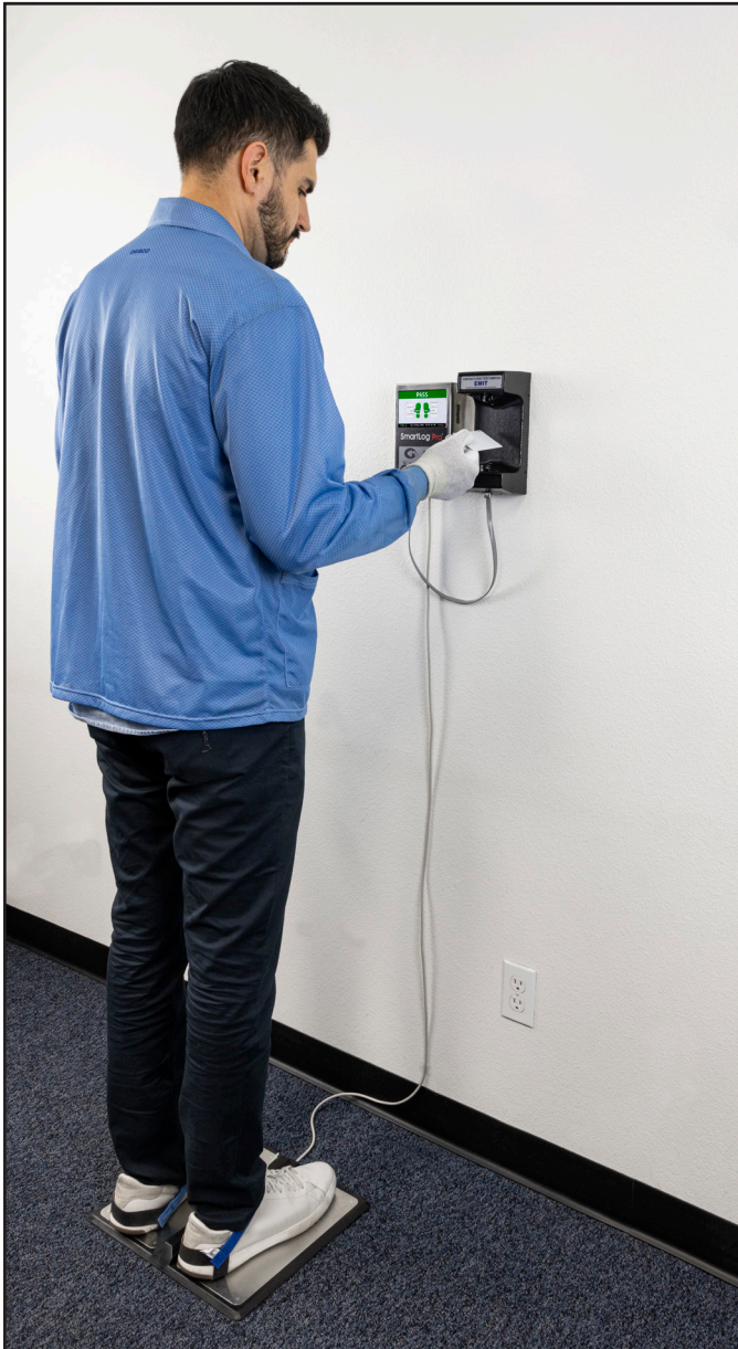
Figure 6. Using the Contactless Test Switch to perform a footwear test with the SmartLog Pro®