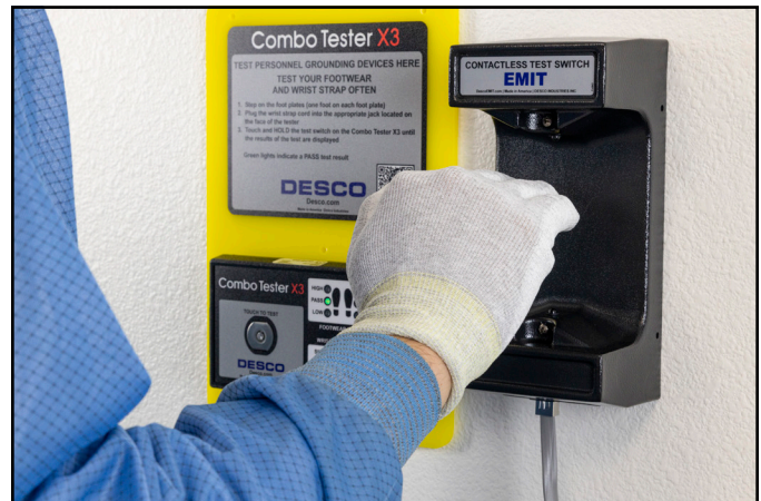
Figure 7. Using the hand to trigger the infrared sensor in the Contactless Test Switch to perform a test with the Combo Tester X3