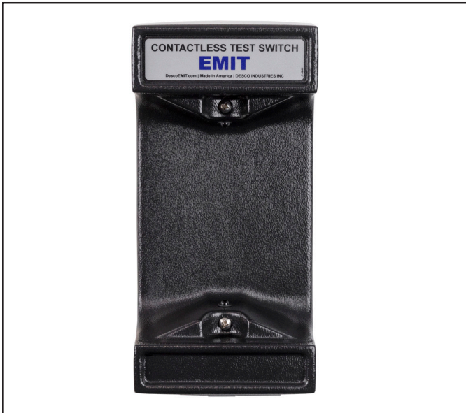
Figure 1. EMIT 50756 Contactless Test Switch