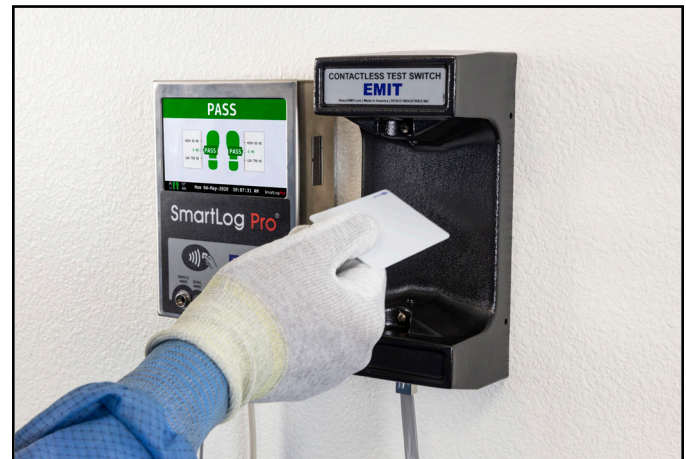
Figure 5. Using a proximity badge to trigger the infrared sensor in the Contactless Test Switch to perform a test with the SmartLog Pro®