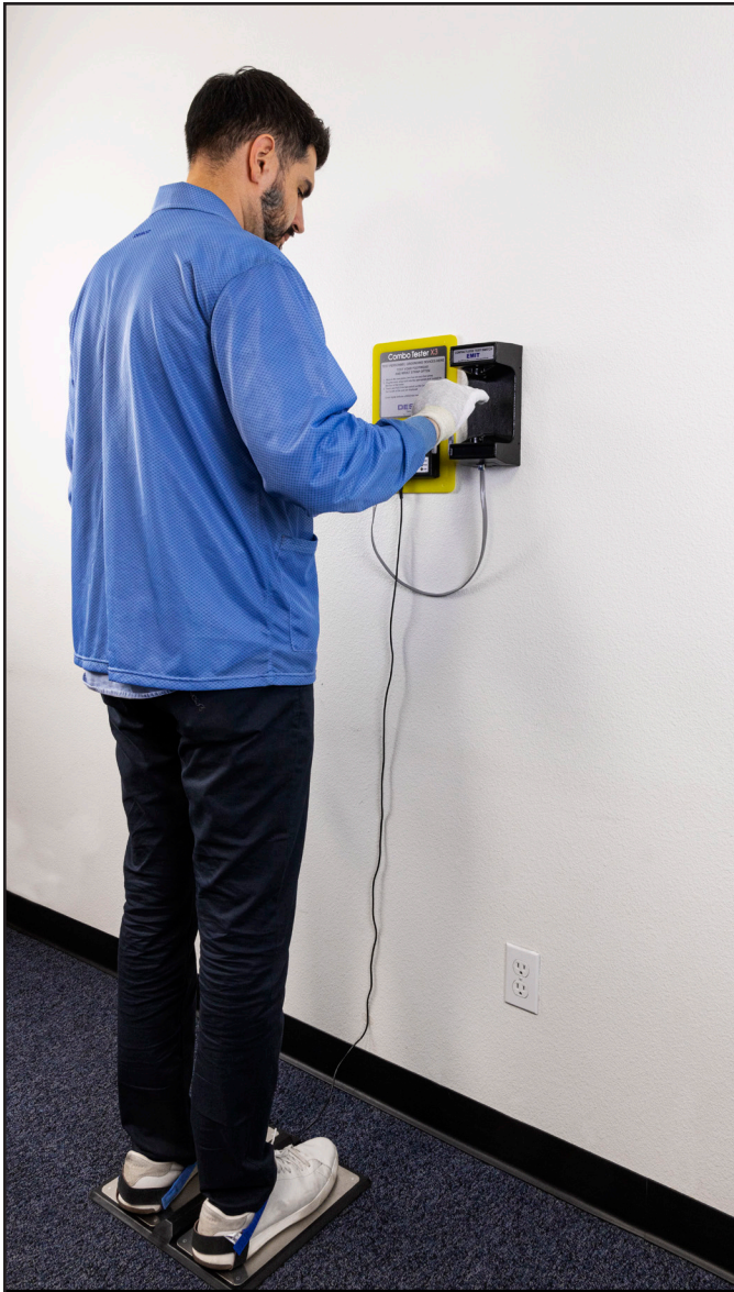
Figure 8. Using the Contactless Test Switch to perform a footwear test with the Combo Tester X3