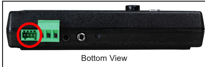
Figure 3. Locating the External Reader port on the Combo Tester X3