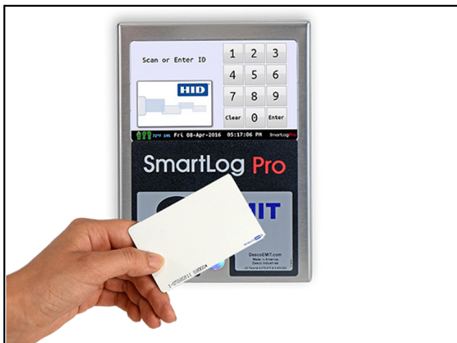
Figure 4. Holding a proximity badge in front of the RFID icon on the SmartLog Pro®

NOTE: Hold the proximity badge in front of the RFID icon for a full second if using proximity badges. See Figure 4.